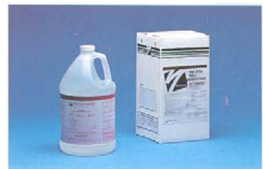
New wall disinfectant detergent. This new one-step, no rinse, cleaner/sanitizer is available for hospital, health care and institutional use. The super-concentrated formula is E.P.A. registered and comes in one-gallon containers.