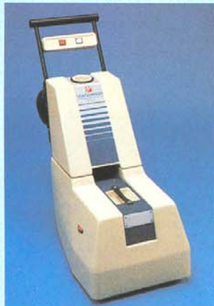
VS1 Dry Foam Carpet Extraction System™