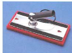
"QUICK-FIT" Heavy-Duty Scrubber Pads. Stubborn scuffs and marks are gone with virtually no effort! Medium & coarse pads available, attach instantly.