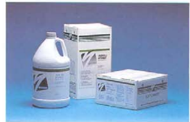
Liquid concentrate and powder. Specially formulated liquid concentrate and powder wall detergents are environmentally safe and effective for painted areas, ceramic tile, stainless steel, vinyl-coated wallpaper, wood paneling and textured surfaces.