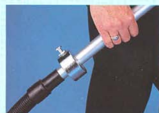
Exclusive, anti-fatigue counterweight pole attachment* puts less stress on arms when cleaning high ceilings. No reaching, no stretching. Easy balance.