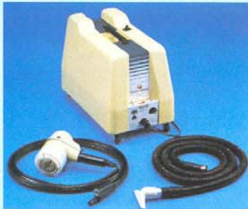
VS2 Upholstery Extraction System™