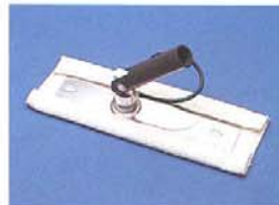
"QUICK CHANGE" Cleaning Pads. Heavy cotton towel/pads attach to glider with Velcro strips for quick, easy change, thorough cleaning.