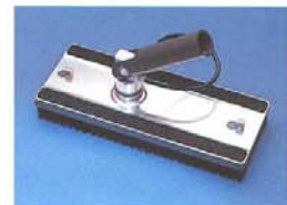
"INSTANT-LOCKING" Brush Attachment. Detergent sprays through bristles to clean brick, stucco, other rough surfaces. Also effective for cleaning fire-smoked walls, awnings, canopies.