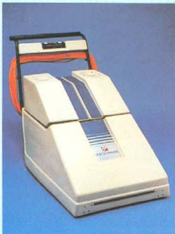
VS Mach-12 High Speed Extraction System™