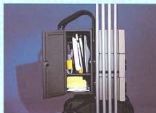
Built-in storage cabinet and shelf for components and supplies. Easy-open push-button door latch.