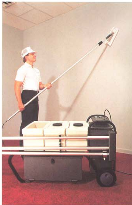
Fast and easy wall cleaning. Now you can clean any washable wall and ceiling surface up to 18' high, with one remarkable system.