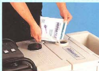
Convenient, one-step mixing of acoustical tile cleaning solution. Just empty pre-measured "Power Pak" into the VersaTile™ solution module and fill with water.