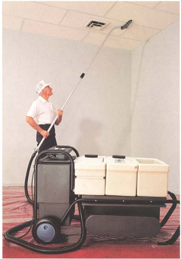
Exclusive built-in vacuum system: powerful and quiet. Removes granular particulates and dust.