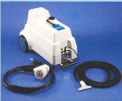
Esprit Upholstery Extraction System