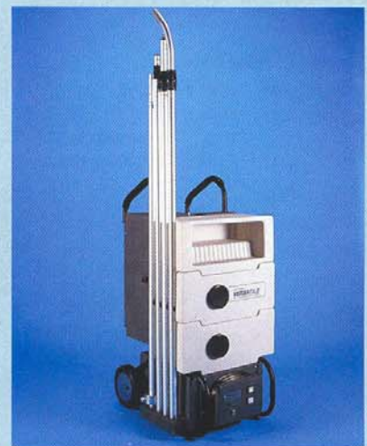
VersaTile™ Wall & Acoustical Tile Cleaning System