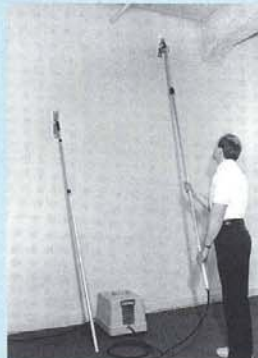
#W853 maxi-reach pole package for cleaning up to 18' high.