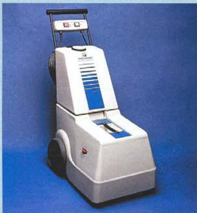
LMX Low Moisture Carpet Extraction System