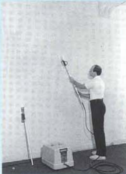
#W852 standard high-reach pole package for cleaning up to 12' high.

Cleaning high walls is now faster & easier. New optional Pole Packages available. No ladders, stools or scaffolding required; clean safely from the floor.