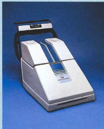
VS Mach-12 High Speed Carpet Extraction System